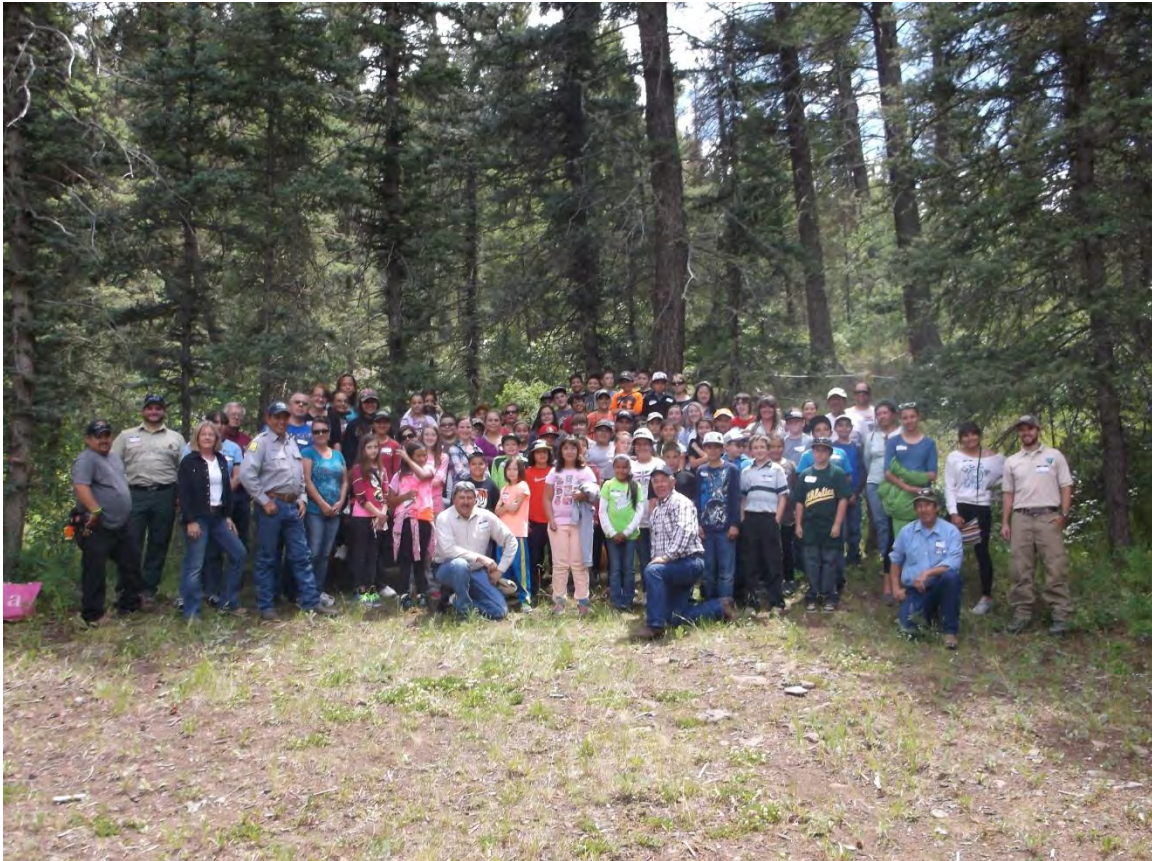
2014 Celestino Romero Conservation Education Camp