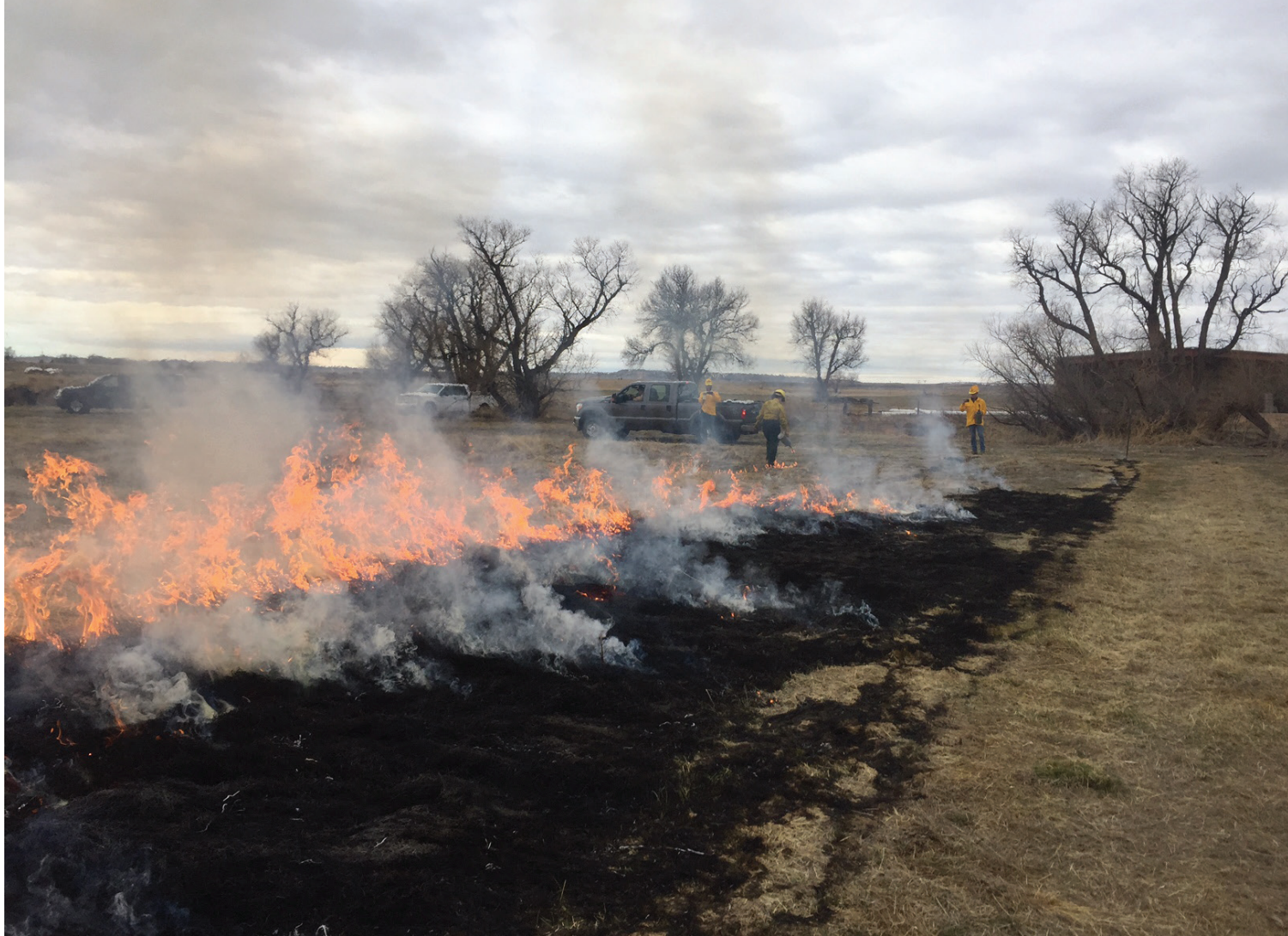
Create a firebreak around the home ignition zone with a prescribed fire before wildfire season. Make sure the burn occurs before conditions become too dry or burn bans restrict the ability to burn.